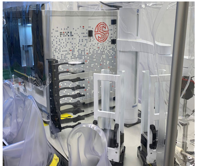
Figure 3: Automated Microbiome research in COY anaerobic chamber

By mounting the colony picker on a turntable, it can be rotated for both automated and manual use. This is especially useful in the restricted work area of the anaerobic chamber allowing laboratories to get maximum flexibility from the instrument.