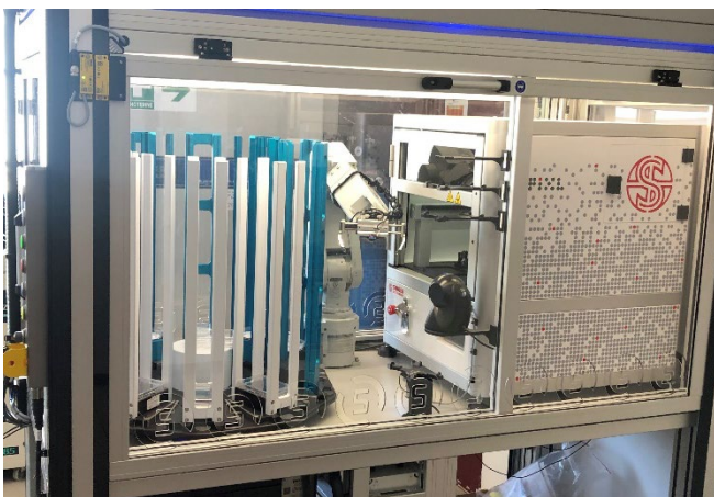
Figure 2: Automated Strain selection in Yeasts