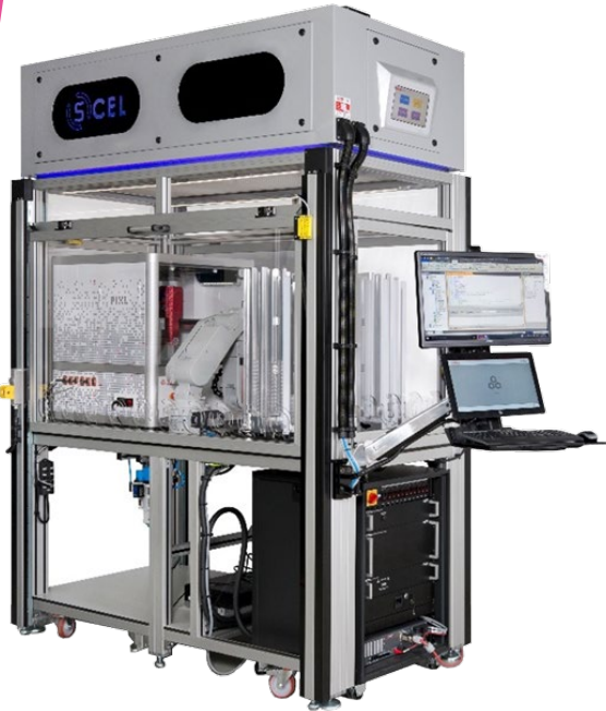
Figure 1: Fully integrated cell picking system